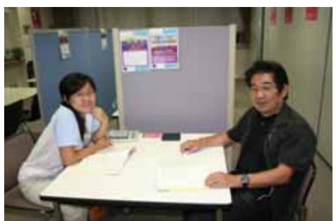
Introductory Japanese course