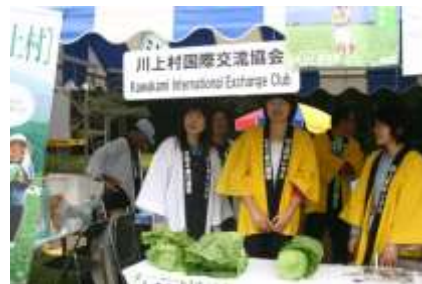
Fellowship Zone, ECO-Rangers Activities