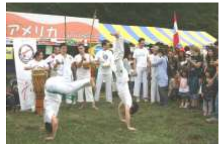
the Multicultural introduce tent 'World Bazaar Attraction'