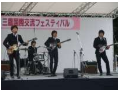
Stage performance Community