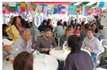
Introduction of MISHOP's activities